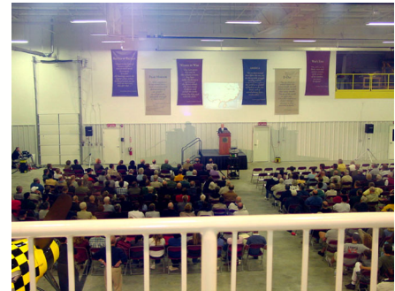
A privilege to be here listening